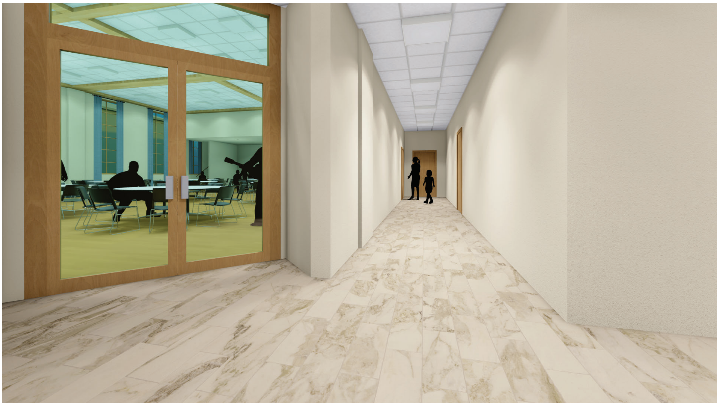
VIEW 5) NEW HALLWAY TO KITCHEN: A PORTION OF THE EXISTING GUILD ROOM WILL BE TAKEN TO CREATE A HALLWAY OUTSIDE OF ROGERS HALL TO THE KITCHEN. THIS WILL ALLOW ACCESS WITHOUT HAVING TO GO THROUGH ROGERS HALL. NEW FLOORING, CEILINGS, AND WALL FINISHES WILL BE INSTALLED.