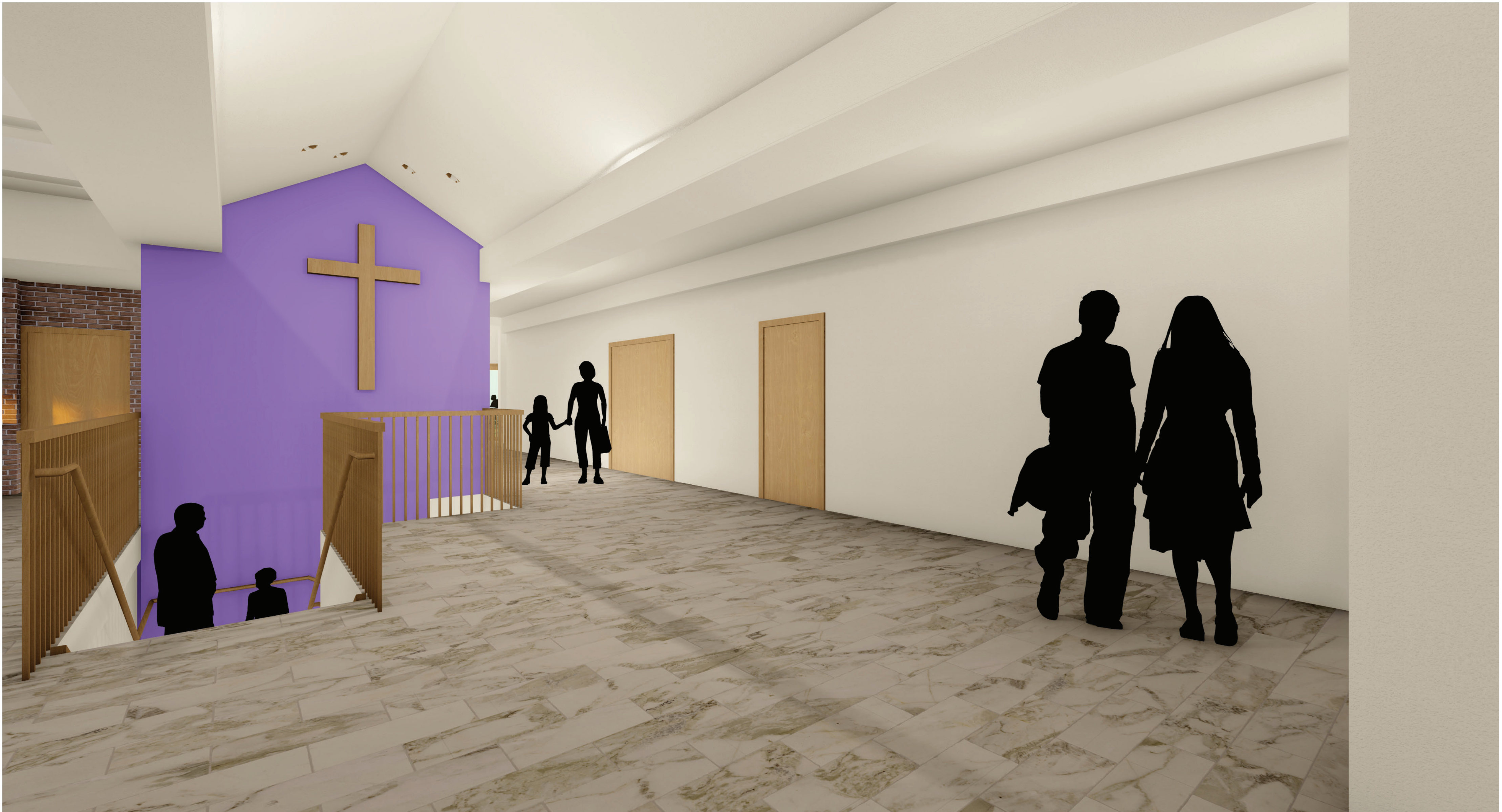
VIEW 3) STAIRCASE IN THE NARTHEX: THE NEW ELEVATOR WILL BE LOCATED WHERE THE EXISTING STAIRS TO MERRICK HALL ARE. A NEW STAIRCASE WILL BE CREATED IN THE EXISTING NARTHEX, AND THE EXISTING CROSS WILL BE RELOCATED TO A NEW WALL WITH A REFRESHED PURPLE FINISH TO HIGHLIGHT THE SPACE.