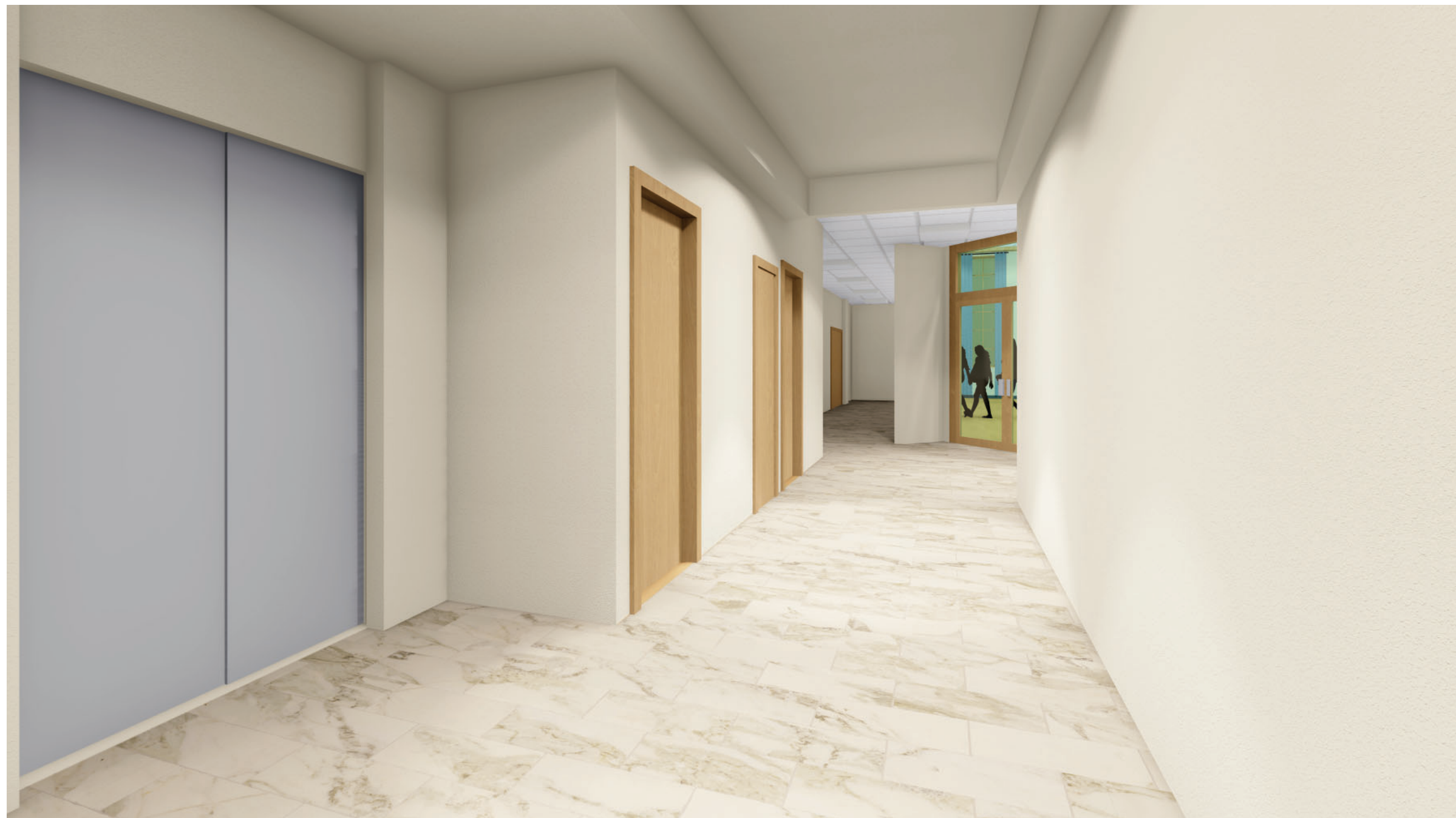
VIEW 4) NEW ELEVATOR AND TOILET ROOMS: AT THE END OF THE HALL IS A NEW FLOOR TO CEILING GLASS DOORWAY TO ROGERS HALL. A NEW HALLWAY WILL BE CREATED TO THE LEFT OF ROGERS HALL TO ALLOW ACCESS TO THE BACK AREA WITHOUT HAVING TO PASS THROUGH ROGERS HALL.